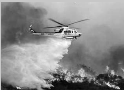
Let's make this a thing of the past, see page 6.